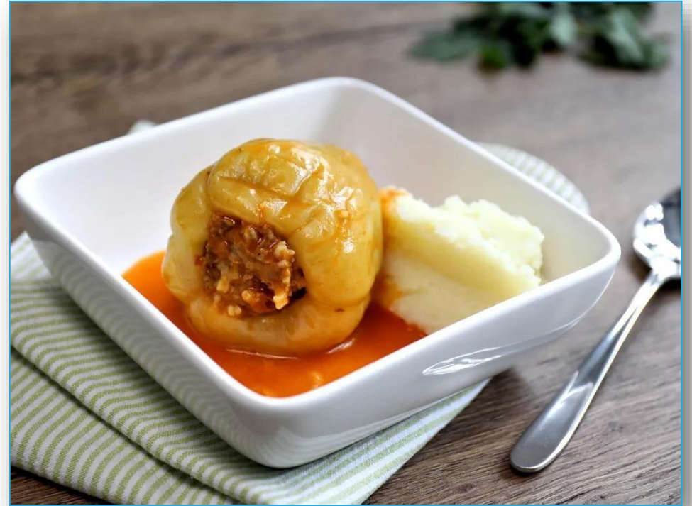
STUFFED BELL PEPPER